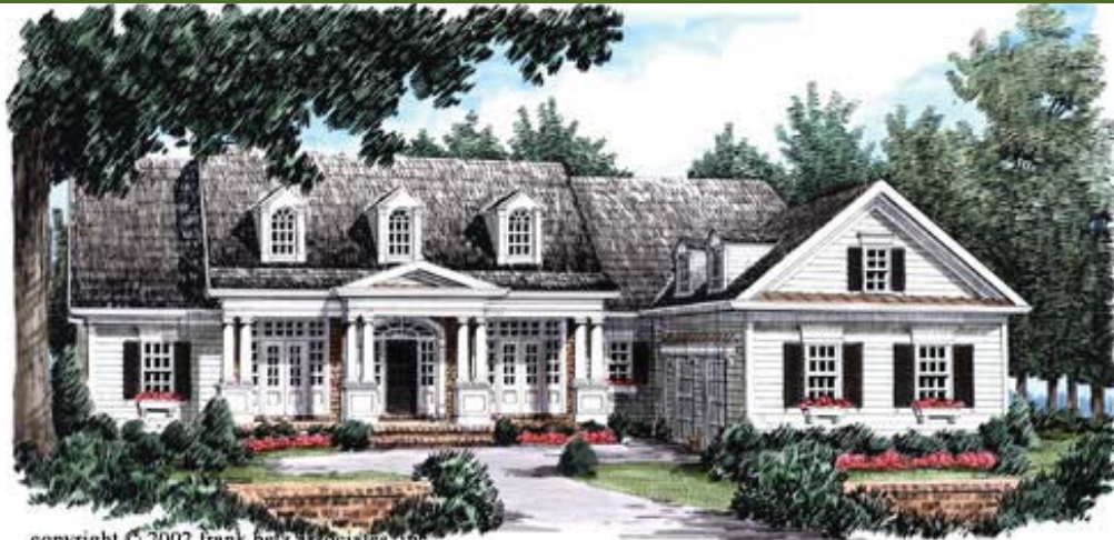
copyright © 2002 Frank betz Associates, inc.